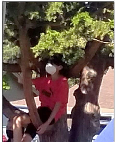
A young worshiper joins the outdoor bilingual service physically distanced from others at Hope Lutheran Church in Woodburn.